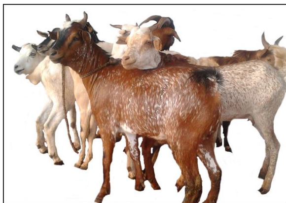
Fig. 1: A photograph of small East African goats from the Morogoro Municipal slaughterhouse, Tanzania.